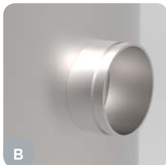
B Victaulic couplings

Material: carbon raw steel Other materials on demand