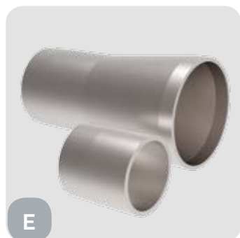
E Transformation to brazed coupling