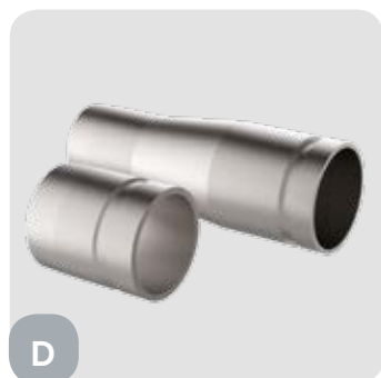
D Transformation to victaulic coupling